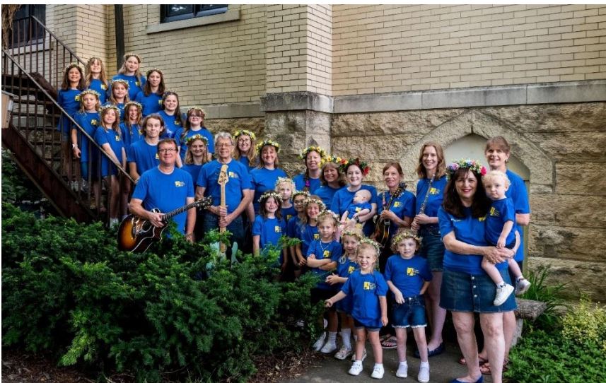
Swedish American Children’s Choir

Cheer on your favorite Geneva’s Got Talent performers as they compete in the GGT Semi-Finals for the chance to move on to the Finals and ultimately win a cash prize! Geneva’s Got Talent is a cooperative talent competition co-presented by the Geneva Chamber of Commerce, the Geneva Park District and Sounds Like Music.